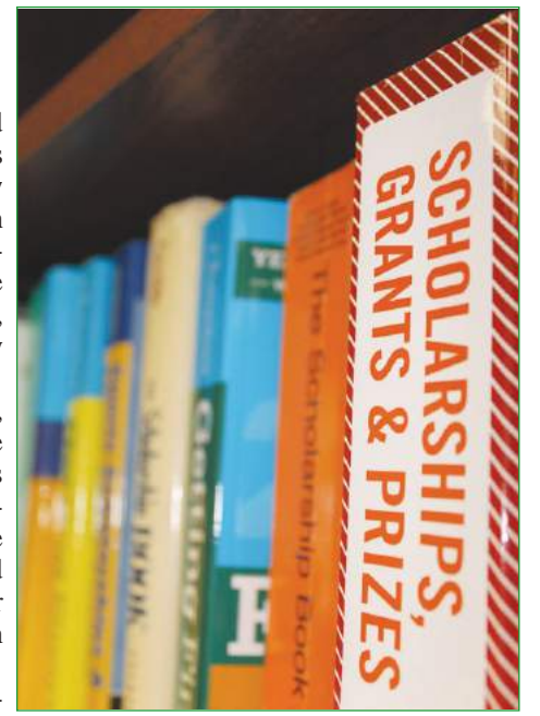
"I think that it's really important to know what about scholarships and colleges scholarships are avail- in the Student Services Office able [...] where you access at MHS, on the MHS website or